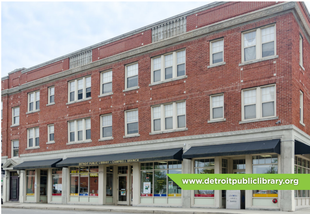
Image of the Campbell Branch